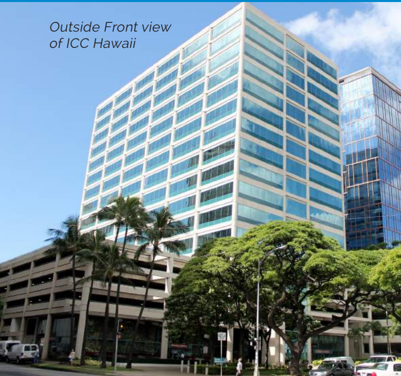
Outside Front view of ICC Hawaii